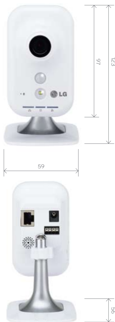
(W)59 x (H)123 x (D)56